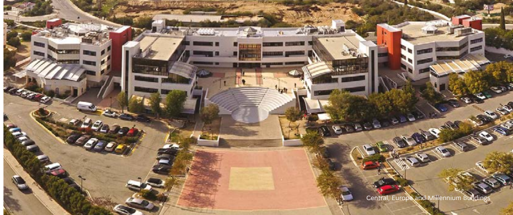
Central, Europa and Millennium Buildings

Many of our degree programmes and departments were the first of their kind in Cyprus. Over time, several programmes such as Medicine, International Relations, Accounting, Law, and Architecture, have developed into some of the most well-regarded in Cyprus and in the region. Today, new programmes focus on cutting-edge research, making us global leaders in certain fields, such as our very successful initiative in Digital Currency/Blockchain Technology.