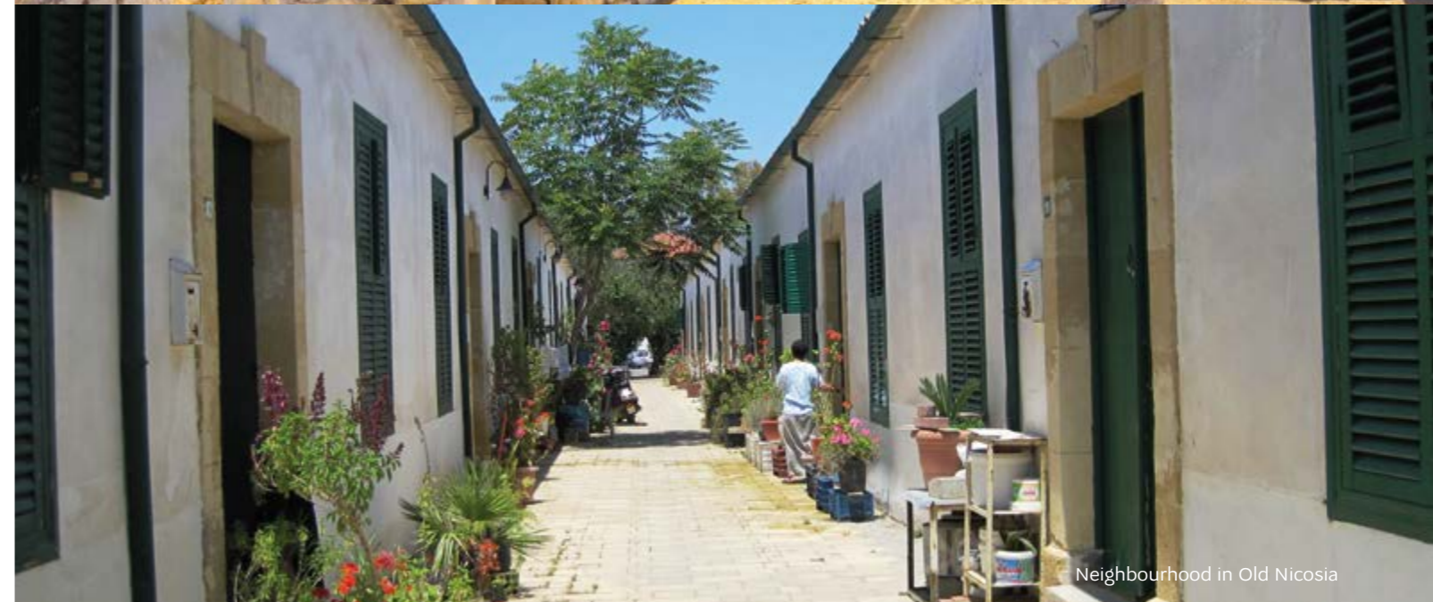
Neighbourhood in Old Nicosia

#1 SMALL CITY in Europe for Lifestyle & Education Outranking OXFORD, CAMBRIDGE AND GENEVA (Financial Times, 2016)