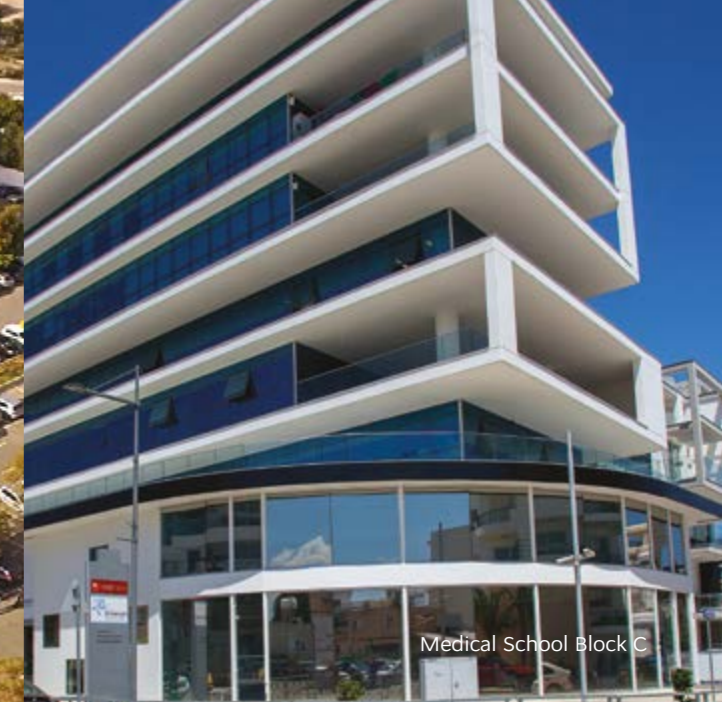
Medical School Block C