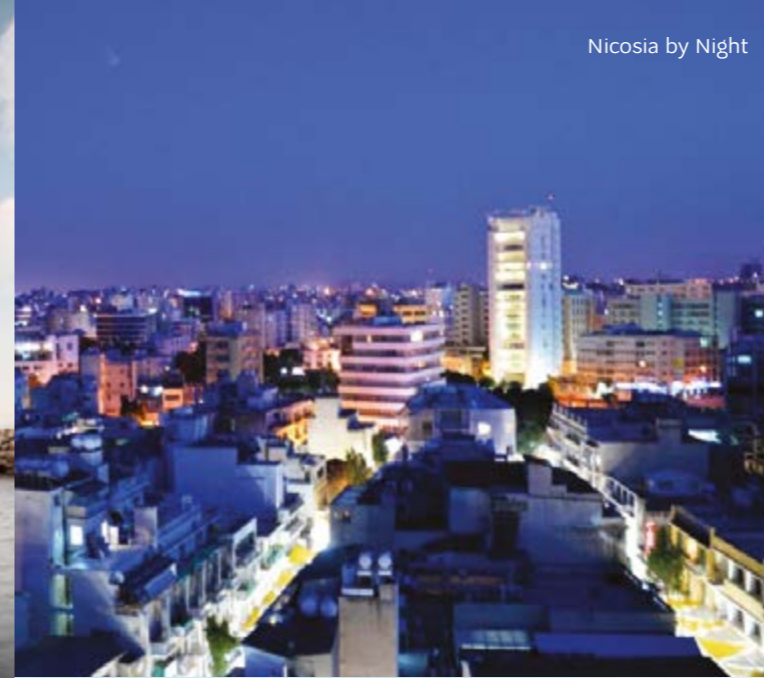
Nicosia by Night