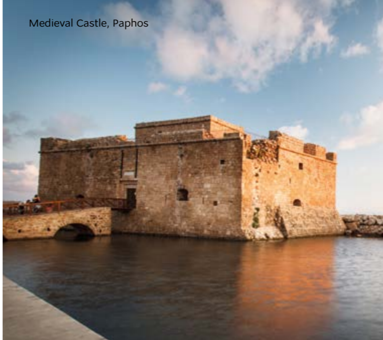
Medieval Castle, Paphos