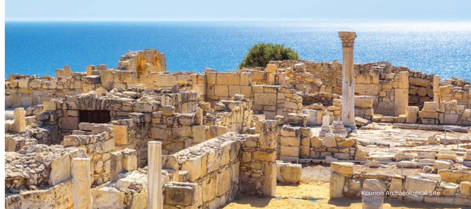
Kourion Archaeological Site

SUNNIEST COUNTRY IN EUROPE with over 300 days of sunshine per year