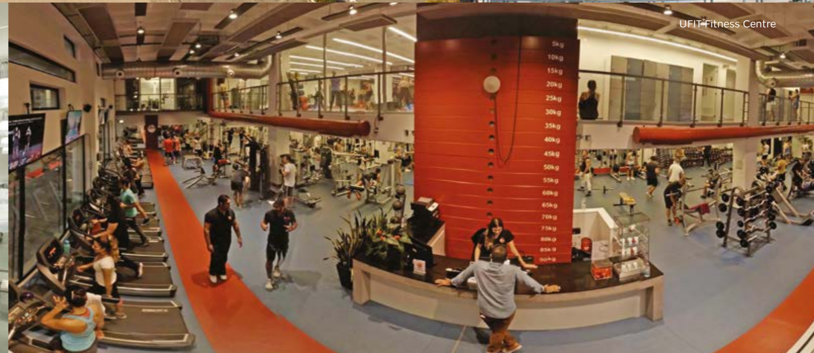
UFIT Fitness Centre